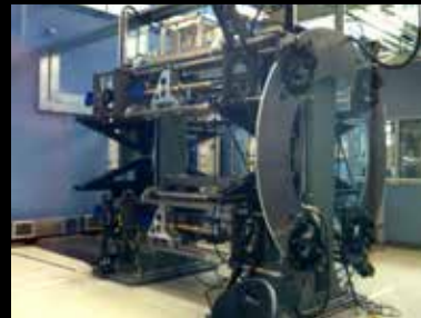
Aircraft endurance and fatigue cycles hydraulic thrust reverser system rig