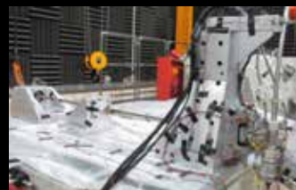
Twelve-hour, 20g vibration exposure