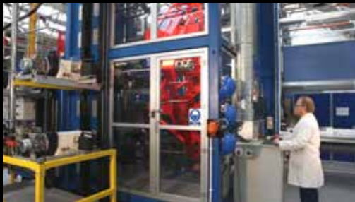
Aircraft endurance and fatigue cycles electric thrust reverser system rig