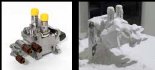
24-hour sand and dust blast exposure