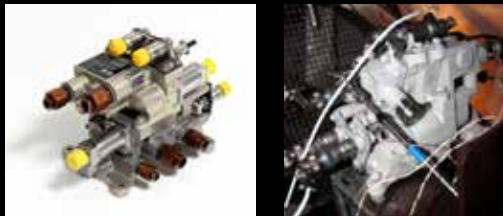
-20° C, 50,000-feet environmental cycling