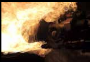
Five-minute 1,093° C fire exposure