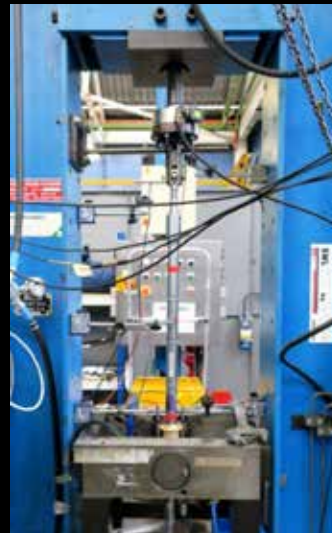
Seven-ton mechanical strength