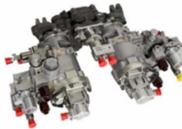
High-lift power drive unit