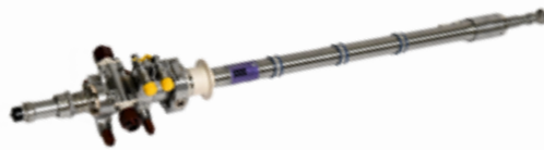
Nacelle locking feedback actuator