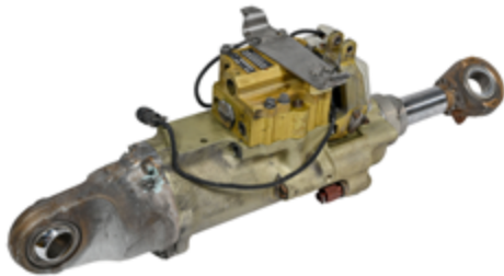
Primary flight control actuator for fixed-wing

At Collins, we understand that each customer has needs and priorities that differ depending on the operation and mission. We offer a broad menu of services, support and pricing options. And we are proud to offer services that are truly flexible, 24/7, 365 days a year.