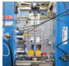
TRAS test rig