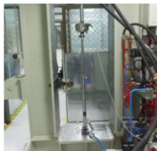
P-DOS test rig