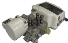
P-DOS power pack with piston pump