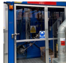
A350 TRAS test rig