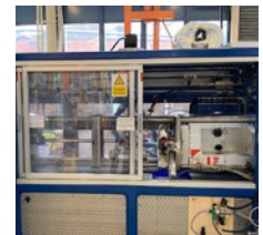
A350 TRAS actuator test rig