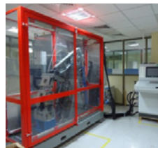
P-DOS test rig