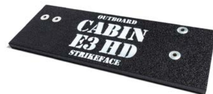
Ballistic panels provide added protection with minimal weight variance over the legacy system

Specifications subject to change without notice.