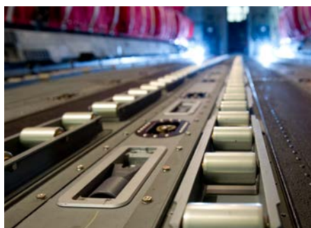
Complete cargo system can be transformed to a troop system in less than 15 minutes