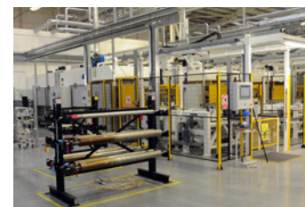
Automated Fuel Pipe Line