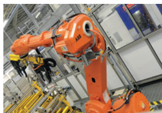
Automated Production Lines