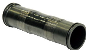
Fully composite fuel pipe