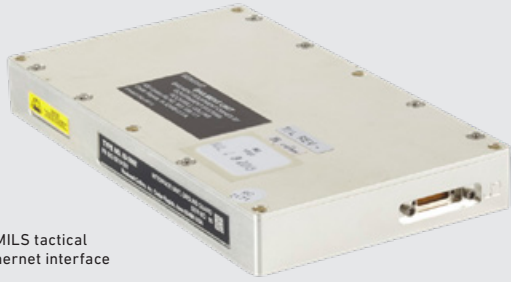
SecureOne MILS tactical CDS with ethernet interface