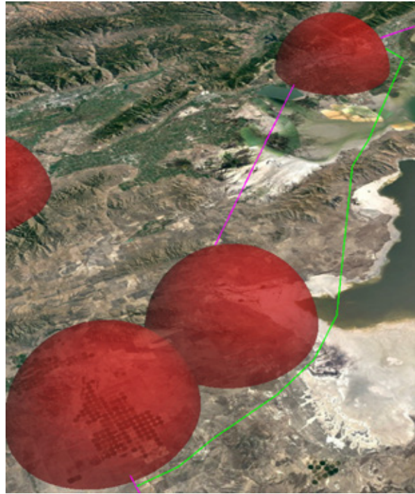
ARR-7000 re-routing around point-radius threats and terrain